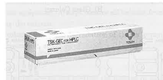
Fig. 1 Appearance of the package

Check that nothing is the matter with the appearance of the package or the column.